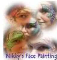
Nikky's Face Painting

Plus: “Painting Smiles - one sparkly face at a time!”