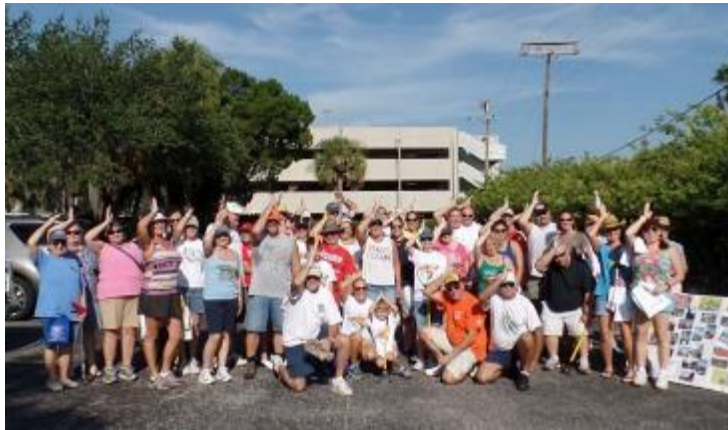
Beach Clean Up