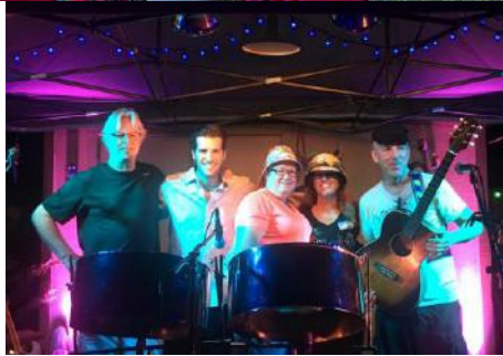
The Habitat - JPs