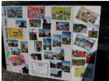
Additional photos available online – finsup.com

Have you taken some awesome photos at a TBPH phlocking? Wanna share them? Of course you can upload to our Facebook page – Tampa Bay Parrot Heads. And you can also upload to - photos@finsup.com